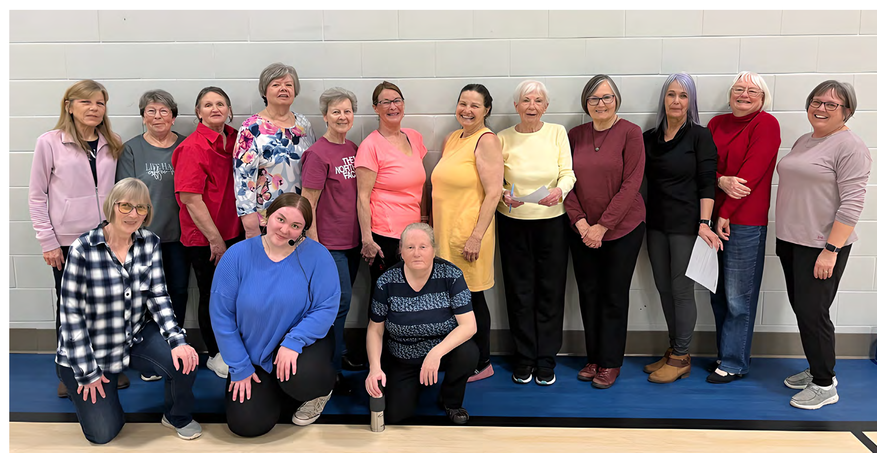
Figure 2 shows participants at the Tuesday morning line dancing program (January–March 2026), a community-led recreational activity supported by The City of North Bay, fostering social connection, wellness, and community engagement.

Figure 1 illustrating the mixed-methods research process, including a scoping review of best practices, survey and administrative data collection, and triangulation of findings to evaluate service delivery and space utilization.